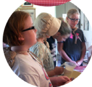
[top] Churning butter. Everyone gets a turn!