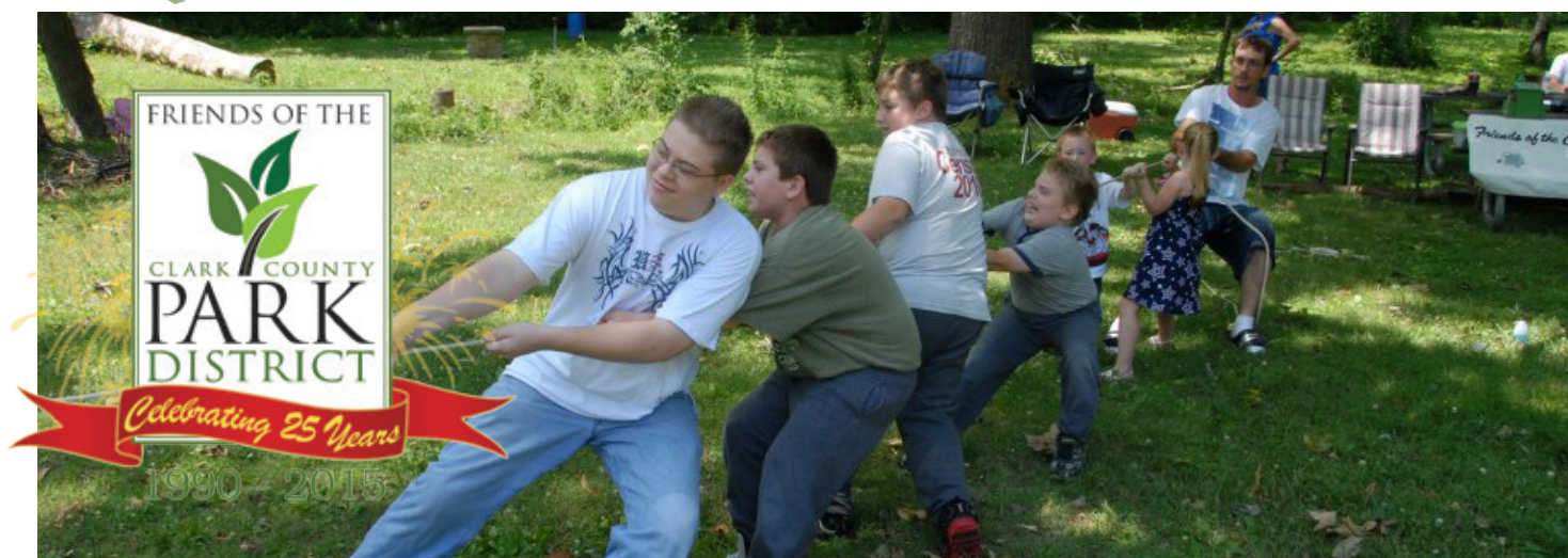
Olde Fashioned 4th of July, 2013. Celebrate our 25th Anniversary of the Friends of the Clark County Park District, Saturday, July 4th at 3:00 p.m., at George Rogers Clark Park.